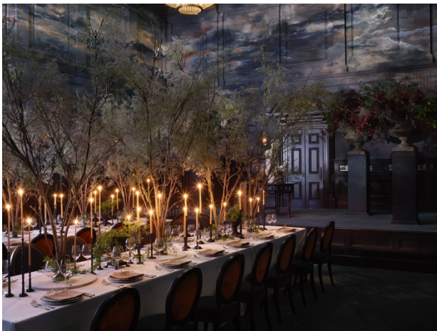
Event Spaces NoMad London United Kingdom

Bertie's Bar offers a "true guest experience" with "no detail left aside, from the personalised whiskey bottle to the logo and bill slip." The glamorous whiskey bar, named in King Edward VII's honour, emulates storytelling through its authentic design.