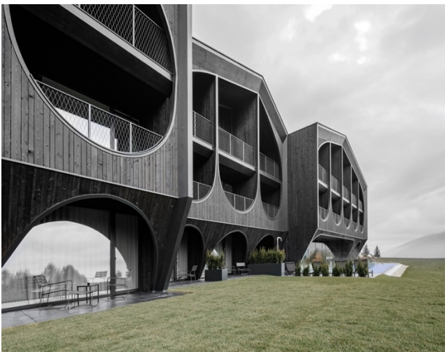
Hotel Newbuild Hotel Milla Montis Italy

The NoMad London converted the historic, grade II-listed building known as The Bow Street Magistrates' Court and Police Station into a fully functional, beautifully designed hotel. "Complex works went into turning this exceptional building into a highly functional hotel", said the judges.