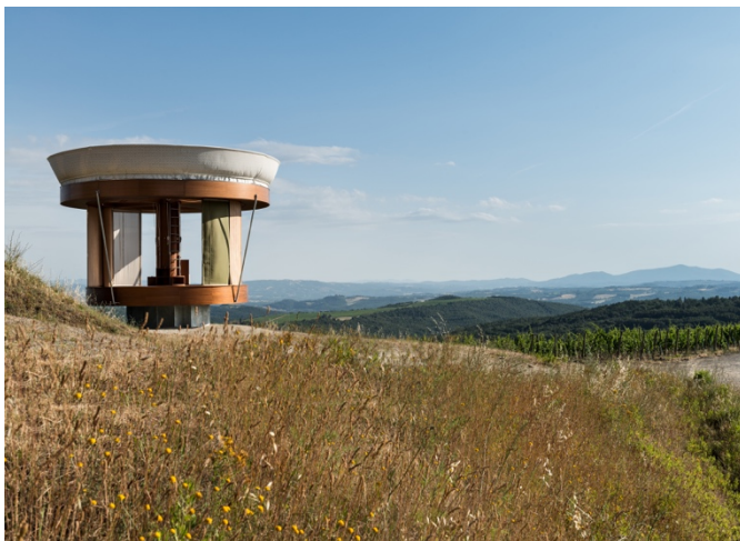
Lodges, Cabins and Tented Camps Casa Ojala Italy

NoMad London’s utilisation of space in and around the hotel was praised by the judges as it “gives a proper guest journey of discovery with strong individual spaces leading to one another.” Every space is “well used and dedicated” whether it’s in the library, concierge or reception, guests will have a sense of anticipation when entering the NoMad’s lobby and public spaces.