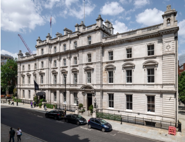
Hotel Conversion NoMad London United Kingdom

AWARDS FOR HOSPITALITY EXPERIENCE AND DESIGN