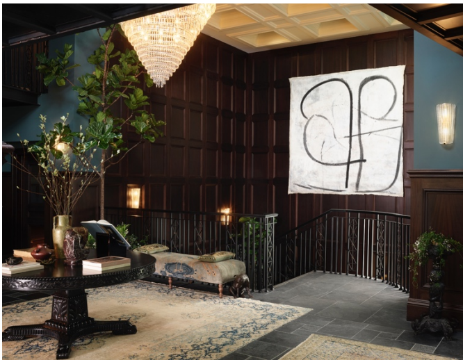
Lobby & Public Spaces NoMad London United Kingdom

The judges praised the “excellent use of the landscape” and focus on “sustainability” by blending the design into the landscape through its clever use of carefully selected colors. The project has set the bar for future projects due to its environmentally friendly approach.