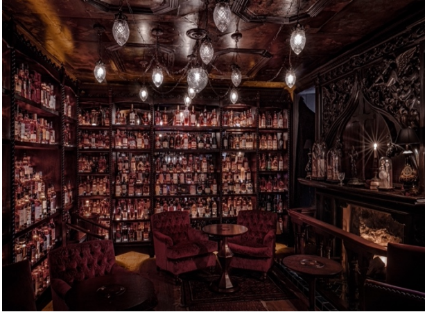
Bar, Club or Lounge The Fife Arms Hotel – Bertie's Bar United Kingdom

Bertie's Bar offers a "true guest experience" with "no detail left aside, from the personalised whiskey bottle to the logo and bill slip." The glamorous whiskey bar, named in King Edward VII's honour, emulates storytelling through its authentic design.