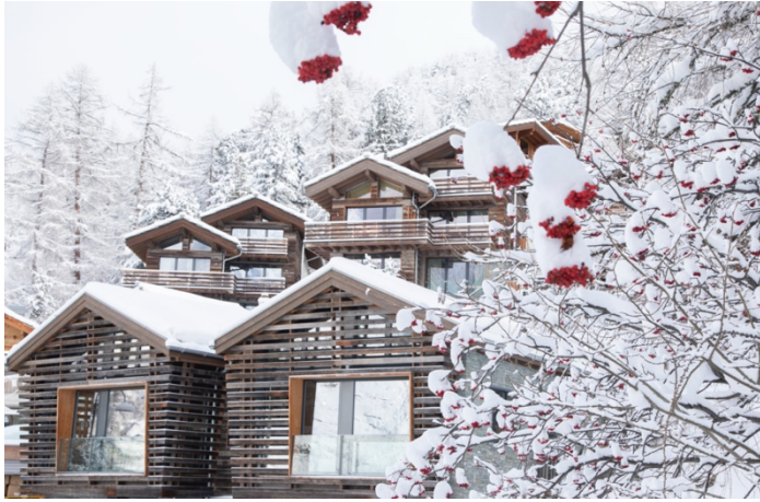
Resort CERVO Mountain Resort Switzerland

AWARDS FOR HOSPITALITY EXPERIENCE AND DESIGN