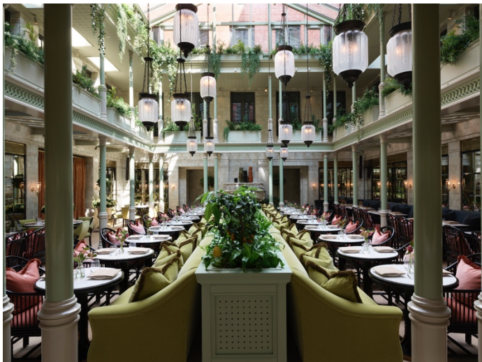
Restaurant NoMad London United Kingdom

“Quirky, responsible and nestling beautifully in its landscape”, the judges concluded that the resort, developed within the Alps, offers “a different type of luxury” which focuses on sustainability and a connection with nature.