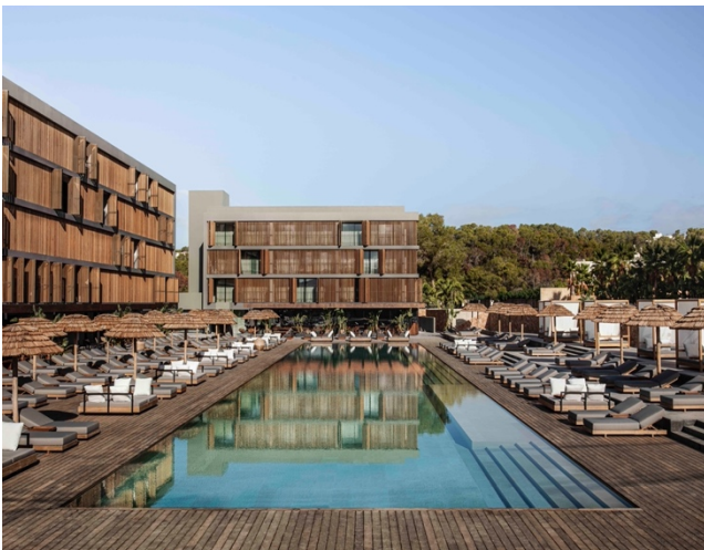
Hotel Renovation & Restoration OKU Ibiza Spain

"Fantastic architecture to which sings out to the mountains and landscape," Hotel Milla Montis' innovative design was led by Peter Pichler Architektur. The judging panel described this unique newbuild as "an unbelievable piece of architecture which blends in with nature together with an impeccable modern interpretation of the traditional mountain chalet."