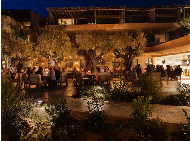
Landscaping & Outdoor Spaces Six Senses Ibiza Spain

AWARDS FOR HOSPITALITY EXPERIENCE AND DESIGN