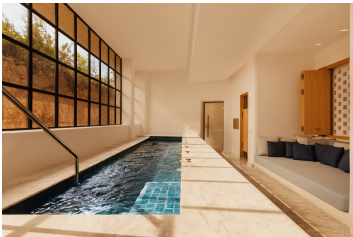
Spa and Wellness Six Senses Ibiza Spain

As soon as diners walk into the landscaped atrium, they are met by a towering glass ceiling which floods the dining area with natural light. The judges complimented the restaurants “clever use of space which gives guests a great arrival experience.”